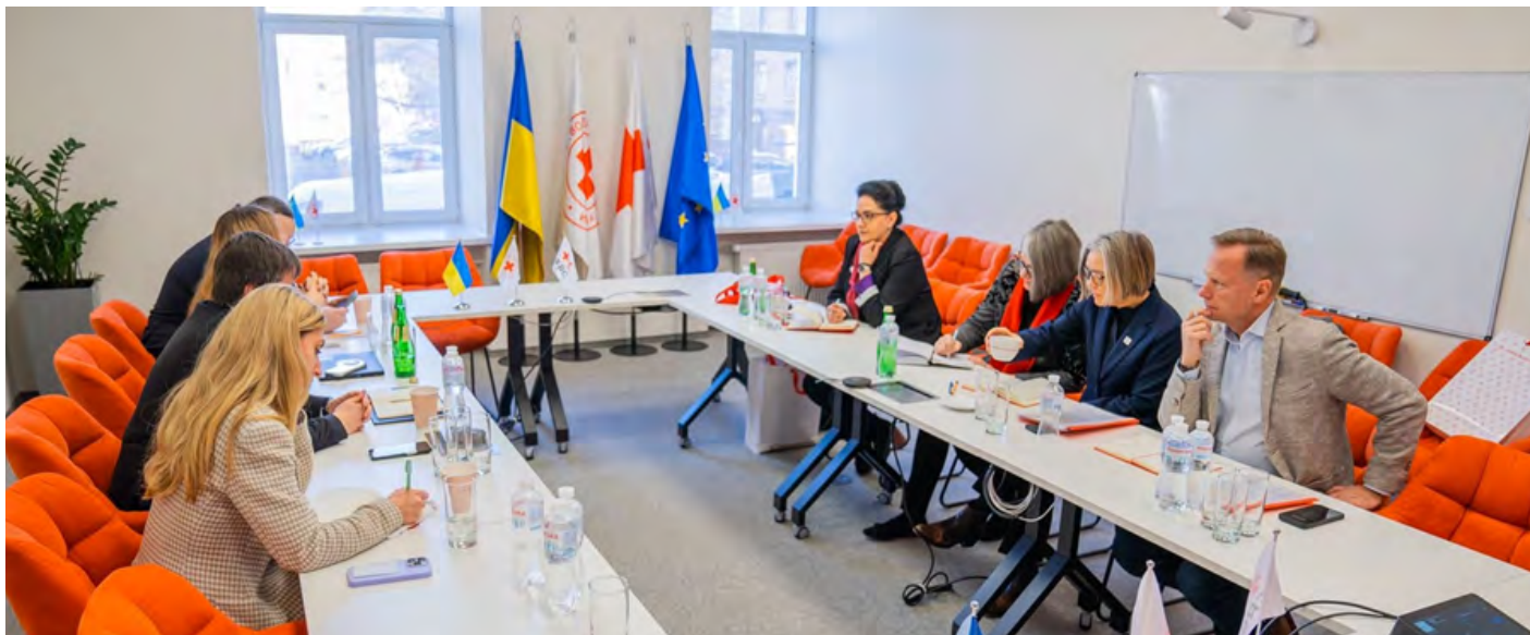
IFRC President's visit to Ukraine. February 2025, Kyiv.

Representatives of the IFRC and the URC also held working meetings with Iryna Vereshchuk, Deputy Head of the Office of the President of Ukraine; Oleksiy Chernyshov, Deputy Prime Minister of Ukraine and Minister for National Unity; Viktor Liashko, Minister of Health of Ukraine; and Mariana Betsa, Deputy Minister of Foreign Affairs of Ukraine, to discuss further humanitarian support for the population of Ukraine.