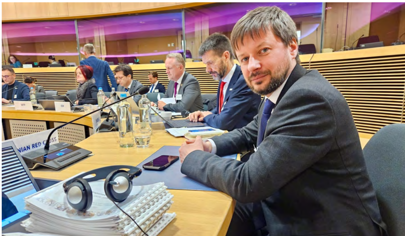
The Fifth Humanitarian Senior Officials Meeting (SOM) on Ukraine. January 2025, Brussels.