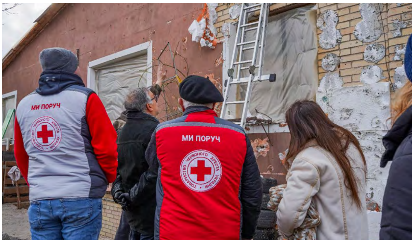
Visit of the French Red Cross delegation to a household recently affected by a UAV strike. March 2025, Bucha.