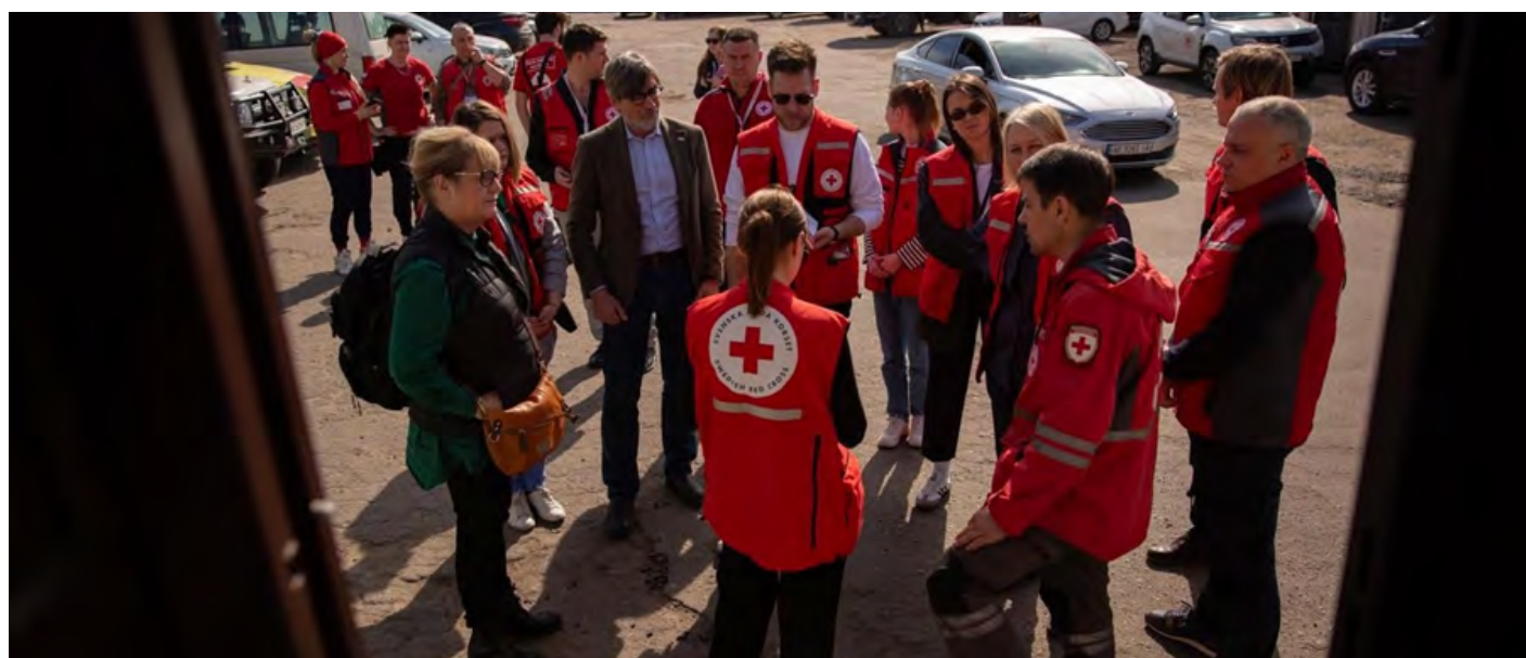
Working visit of the Swedish Red Cross to the Odesa region. March 2025, Odesa.