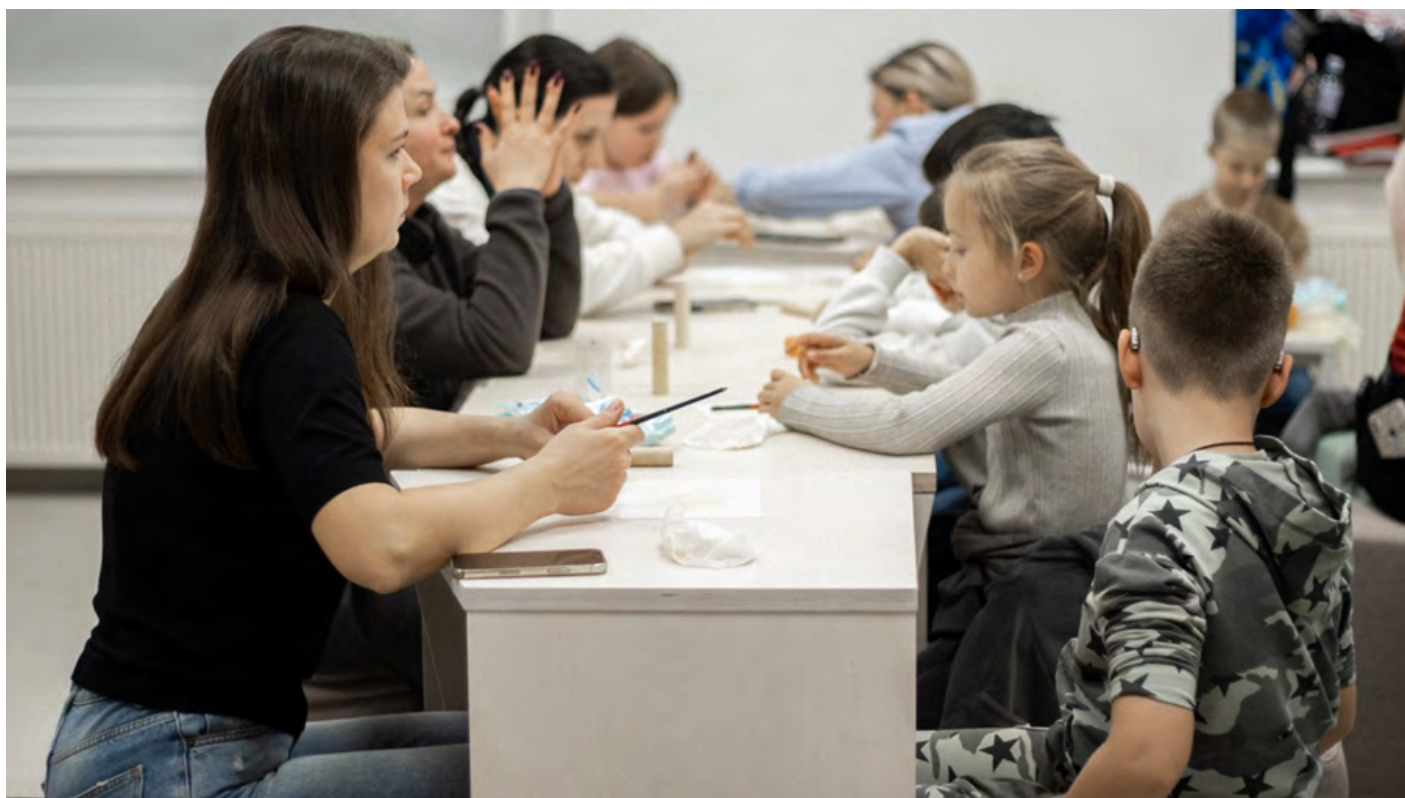
The Lithuanian Red Cross organised a children's clay modelling masterclass for families displaced from Ukraine. The initiative was supported by #EU4Health. 28 October, 2024.

National Societies from countries that have made an official request to join the EU and for which an official date for EU entry has been fixed are invited to join the Red Cross EU (RCEU) Office as observing members. The URC became eligible as an observing member on 28 February 2022 , when Ukraine officially submitted a letter of application for EU membership. Since the full-scale invasion on 24 February 2022, the RCEU Office has provided regular updates to its members on EU policy and funding initiatives for Ukraine and facilitated members' input towards the EU institutions on their individual and joint operations. This support included an analysis of the Temporary Protection Directive, regular assessments of the European Commission's guiding documents, and recommendations on the EU's response towards people displaced from Ukraine. The RCEU Office also promoted URC's participation in high-level EU events, such as the European Humanitarian Forum, organised briefings for the URC with the EU Member States in the Council working parties for humanitarian aid (COHAFA), civil protection (PROCIV), and political crisis (IPCR), and facilitated bilateral exchanges with the European Commission (DG ECHO, DG NEAR, DG HOME, and DG SANTE) – complementing ongoing dialogue in Kyiv with the EU Delegation and DG ECHO field representatives.