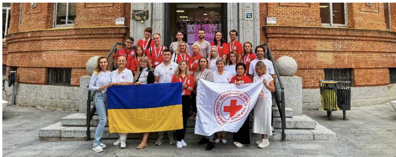
URC delegation during the visit to the SRC Headquarters. September 2024, Madrid.

mobilization, and youth involvement. For URC, it was an opportunity to observe first-hand how SpRC integrates volunteers into every aspect of its operations and to take valuable lessons back to Ukraine.