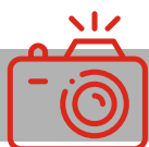
Photo exhibition on URC humanitarian response at la Gaîté Lyrique, Paris, on 10 December, 2024.

Youth Diplomatic Forum on Ukrainian humanitarian diplomacy in Kyiv, on 18-19 November, 2024.