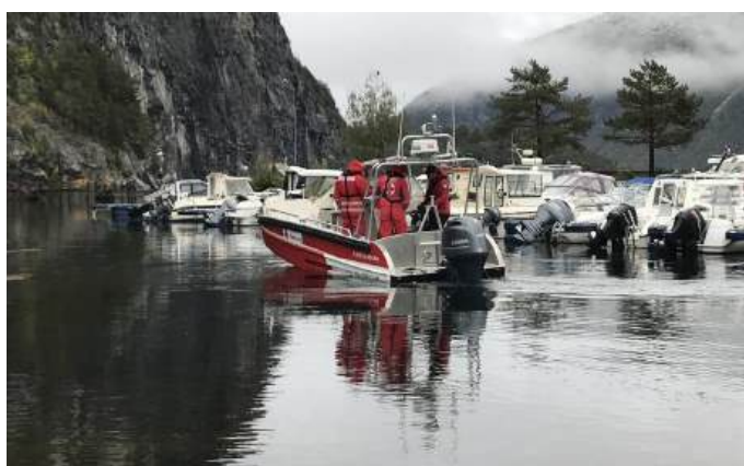
URC delegation visit to the Norwegian Red Cross. October 2024, Oslo.