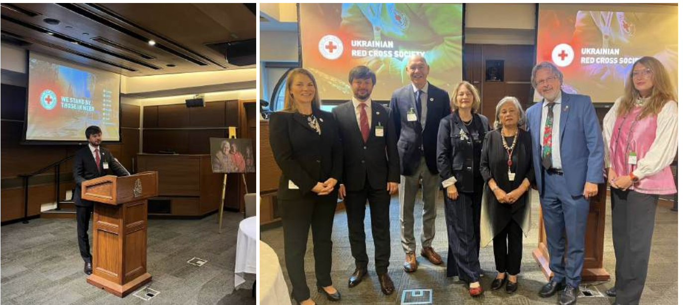
Representatives of the URC and CRC at the meeting with Canada's Minister of International Development. September 2024, Ottawa.

On 19 September, with the aim of raising the profile the work of URC humanitarian response in Ukraine, at the invitation of Canadian Senators Omidvar, Kutcher and Dasko, a Parliamentary breakfast was held with the participation of federal government representatives, including 5 members of Parliament and 11 senators, specifically those engaged in foreign affairs, international development and response in Ukraine.