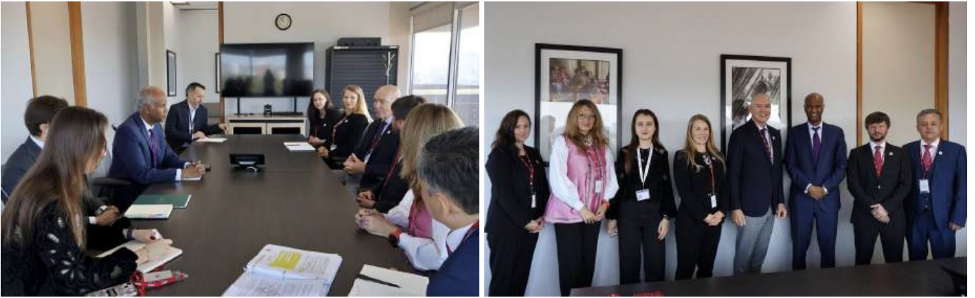
Representatives of the URC and CRC at the meeting with Canada's Minister of International Development. September 2024, Ottawa.