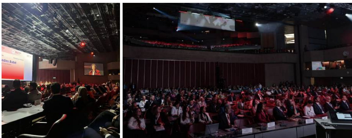
34 International Conference. October 2024, Geneva.