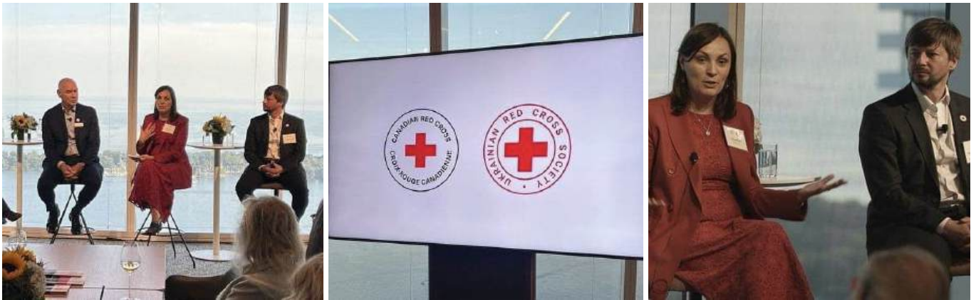
Charity event "Partners in Humanity: An Evening with the Ukrainian Red Cross». September 2024, Toronto.