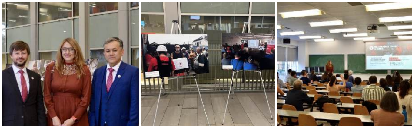
Representatives of the URC and CRC at Carleton University. September 2024, Ottawa.