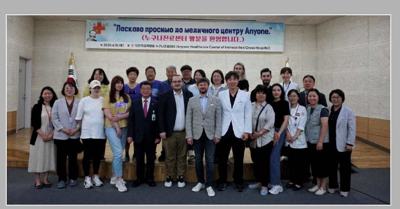
Representatives of the Ukrainian Red Cross in the Incheon Red Cross Hospital. June 2024, Seoul.

particular attention to current humanitarian challenges that vary widely across the country. Meeting with the Ambassador Extraordinary and Plenipotentiary of Ukraine to the Republic of Korea was an opportunity to express gratitude for support and assistance in developing bilateral partnerships.