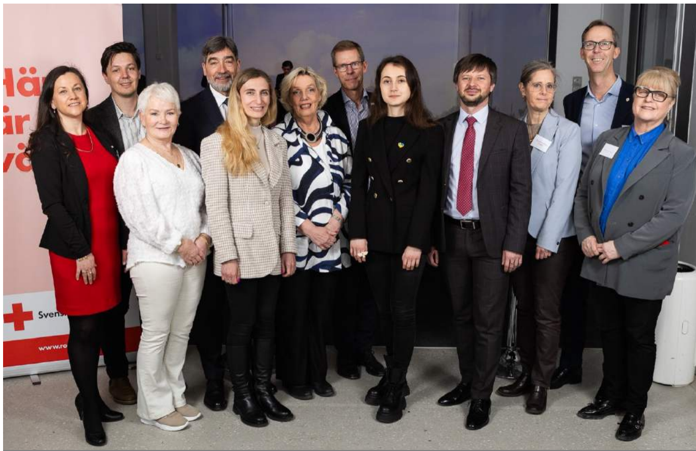
Representatives of the Ukrainian Red Cross and the Swedish Red Cross at "Through Ukrainian Eyes" seminar. April 2024, Stockholm.

The seminar was also attended by the Former Minister of Foreign Affairs of Sweden, representatives of the Swedish International Development Cooperation Agency, the Folke Bernadotte Academy, the Swedish Civil Contingencies Agency, national media Sveriges Television, Volvo and Electrolux companies.